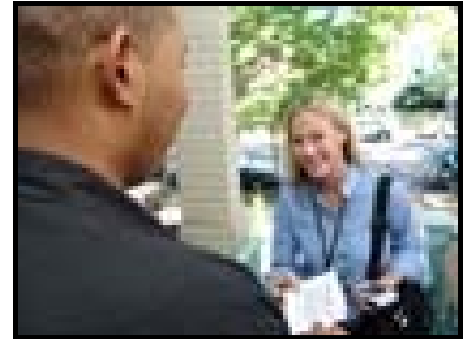
Greeting the canvasser

In our last issue we wrote about the role of canvassing and how that was effective in identifying structures with addresses in preparation for mailing the Census questionnaire. We also reported that this will be the shortest questionnaire in Census history. It is good to remind everyone in the early childhood professions that our programs for quality child care and early education depend on an accurate count. This will take a small effort on your part—to remind families that the Census is easy, safe, and completely confidential. There is much to be gained, approximately $1400 per individual in Idaho, and that same amount to be lost if even one person decides that this is not important.