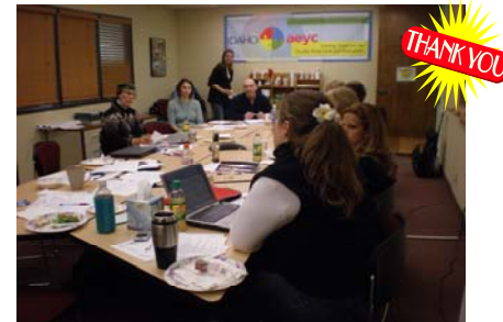
Board members discuss matters over lunch at a meeting in March in Boise.

Thanks to the individuals listed below for volunteering time helping with the website, clerical tasks, answering phones, creating display boards, assembling furniture, copying documents, assisting with mailing, entering data, and various other tasks including offering thoughts and support.