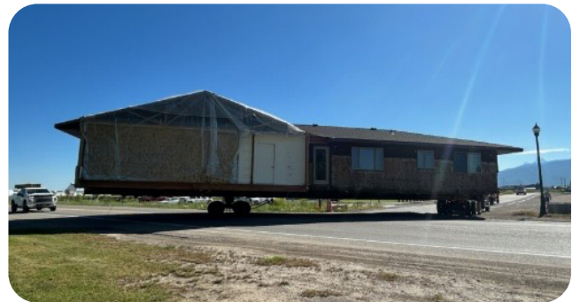
Gamble House being moved to Teton School District property in Driggs for the creation of a new child care facility

The Teton Valley Collaborative for Early Learning celebrated the opening of a child care center this year at the newly relocated and remodeled Gamble House. This achievement was the result of incredible investment and coordination between Teton School District, Sweet Spirits Preschool & Child Care, Idaho AEYC, private donors and additional stakeholders. In June, the Gamble House was donated and moved onto school district property. In September, Sweet Spirits began providing care in a community that has been struggling to keep child care businesses afloat. Idaho AEYC has been a proud partner in this process!